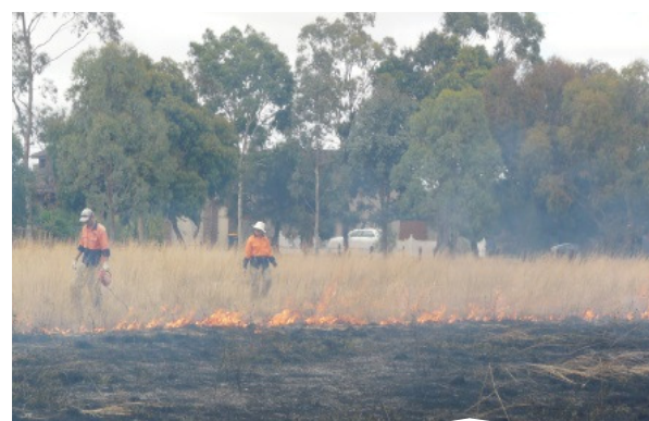
MCMC's parkland crew conducting a burn at Allan Reserve, Keilor East