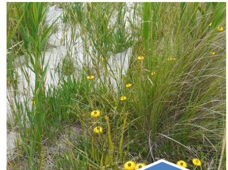
Swamp Everlasting, a vulnerable species thriving where highly competitive weeds have been controlled as part of the Melbourne Water grant at Hearn's Swamp along a railway Reserve in Wallan.