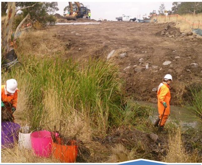
Plant salvage at 'Merri Crossing' in March prior to gas pipeline installation.