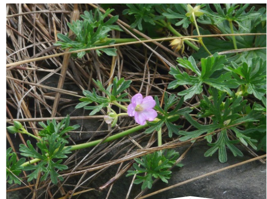
Large-flowered Geranium, MCMC cooperated with DEPI on actions to conserve this species.