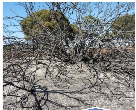
A room-sized Boxthorn- disarmed by the intense fire at Lorne Street, Fawkner.