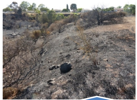
Over 500 metres of creek frontage, was burnt by the fire which narrowly missed damaging houses and factories.